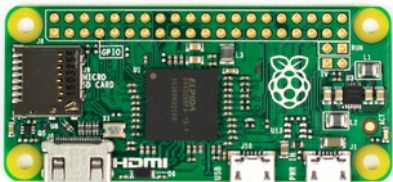
Raspberry Pi Zero