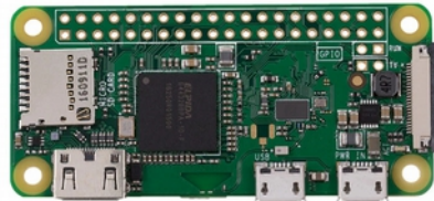
Raspberry Pi Zero W/WH