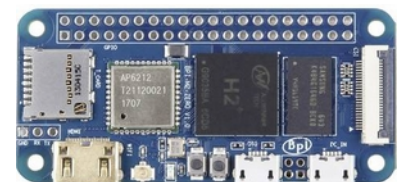
Banana Pi BPI Zero